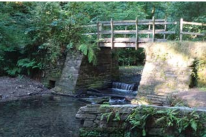
Old weir and footbridge on the Morden Stream above Cotehele Mill