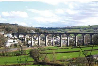
Calstock Viaduct, seen from a viewpoint towards the end of the route