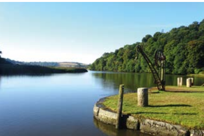
The peaceful River Tamar at Cotehele Quay on a hot summer morning