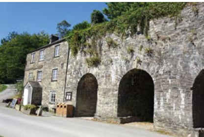
Georgian limekilns on Cotehele Quay