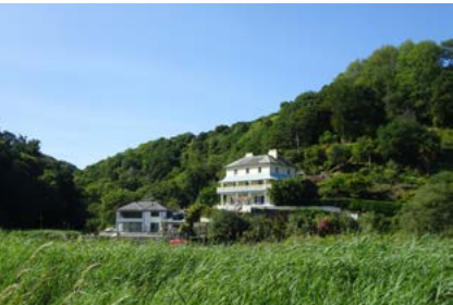
Danescombe Valley House