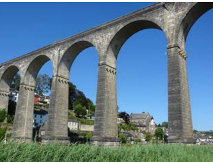
Calstock's impressive and lofty railway viaduct