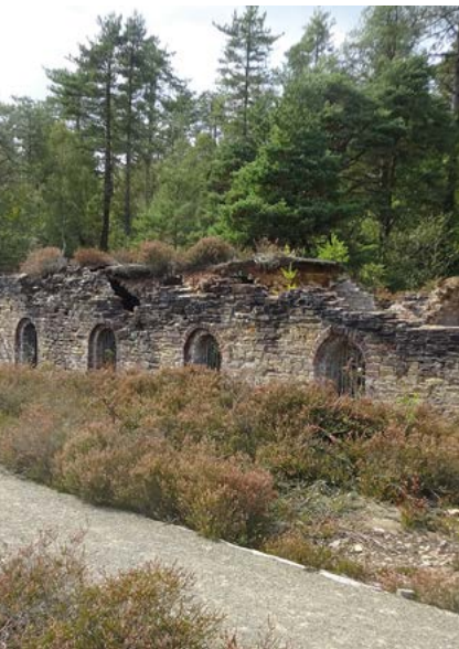
The extensive ruins of Wheal Anna Maria arsenic works