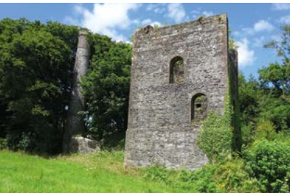
Chimney and winding engine house, Holmbush Mine: remnants of a once-flourishing industry