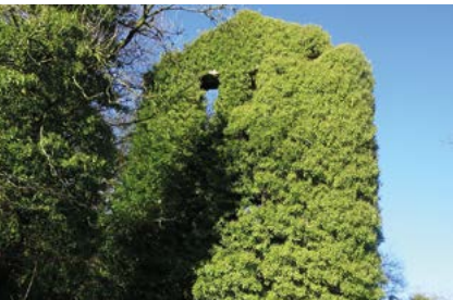
Ivy-covered remains of Hitchen's pumping engine house