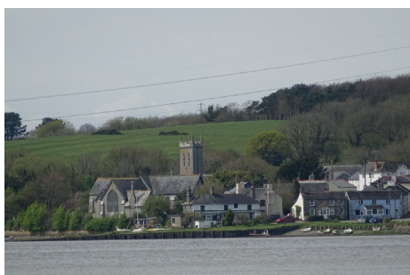
Bere Ferrers comes into view on the west bank of the river