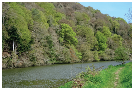
Whittacliffe Wood, seen upriver from the embankment path