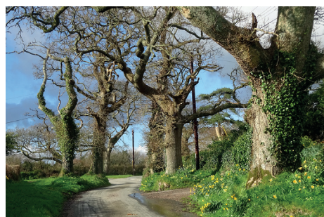
Oak trees and daffodils beyond Pound Cross (long walk)