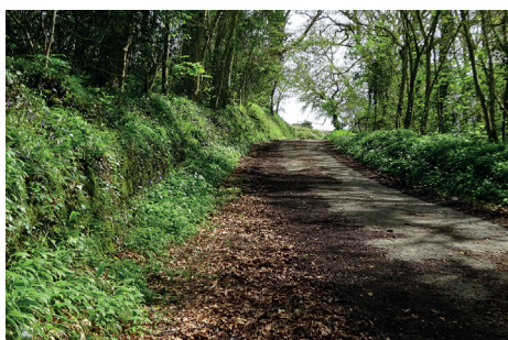
The lane ascends above Ashleigh Bottom