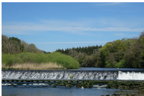
Lopwell Dam: a ferry once crossed the River Tavy here

5 SX 485639 Turn left to pass cottages and a line of superb oak trees. At the next lane junction keep left (Milton Combe right) and then follow the peaceful lane – the views ahead are glorious, stretching into Cornwall – down into the Tavy valley, passing Maristow Barton and another lane to Milton Combe. Continue downhill, eventually bearing right to Lopwell Dam.