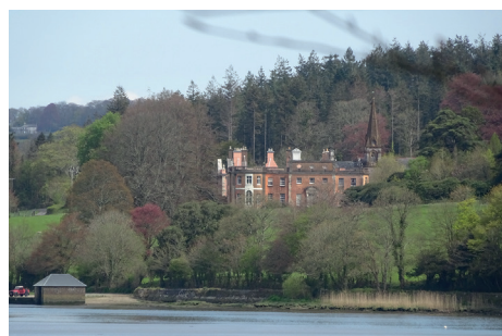
Maristow House, with the quay below