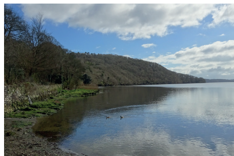
The Tavy broadens below Maristow Quay