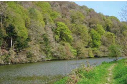
Whittacliffe Wood, seen upriver from the embankment path