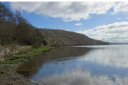
The Tavy broadens below Maristow Quay