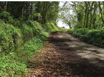
The lane ascends above Ashleigh Bottom