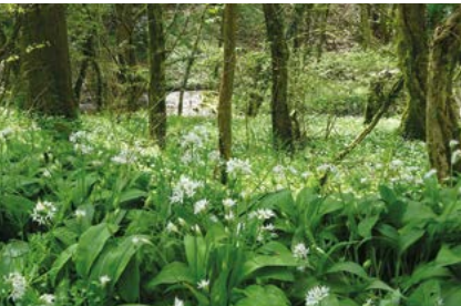
A carpet of ramsons (wild garlic) in Ashleigh Bottom