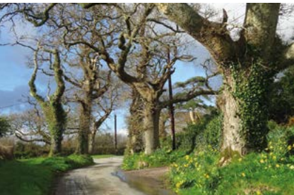
Oak trees and daffodils beyond Pound Cross (long walk)