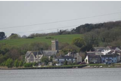
Bere Ferrers comes into view on the west bank of the river