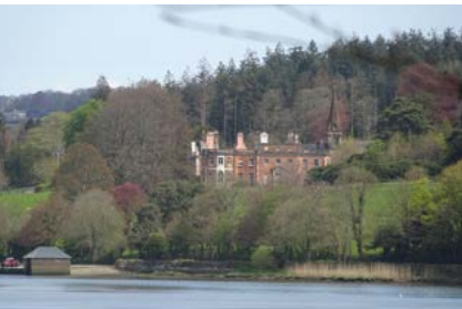
Maristow House, with the quay below