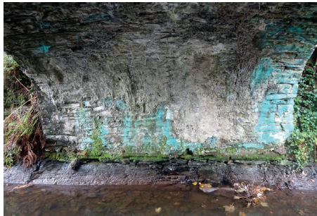
Copper staining under Crowndale Bridge