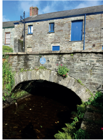
Tavistock Canal wharf, with the old granary beyond the bridge (above the canal)