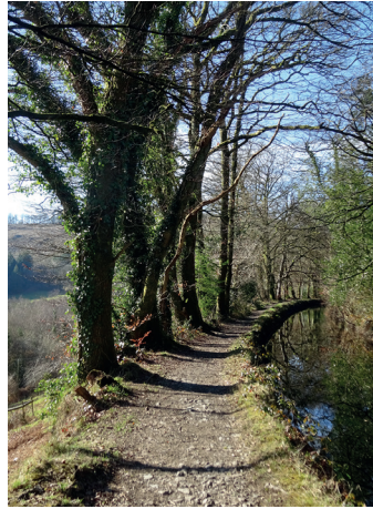
The impressive Shillamill Viaduct