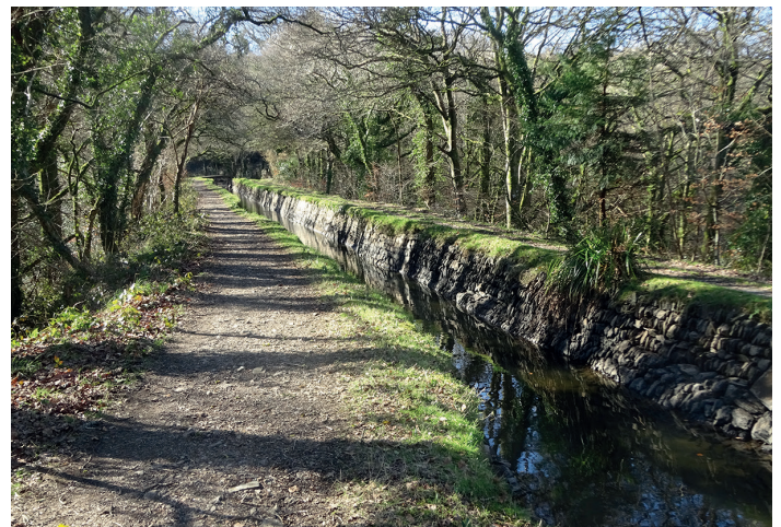
An aqueduct carries the canal across the valley of the River Lumburn