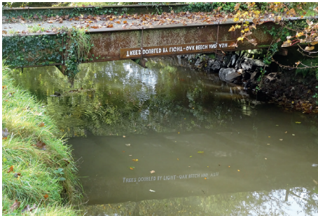
Keep any eye out for the Poetry Trail all along the canal