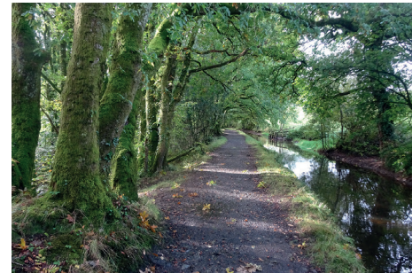
The Tavistock Canal: a peaceful, easy walk all year round