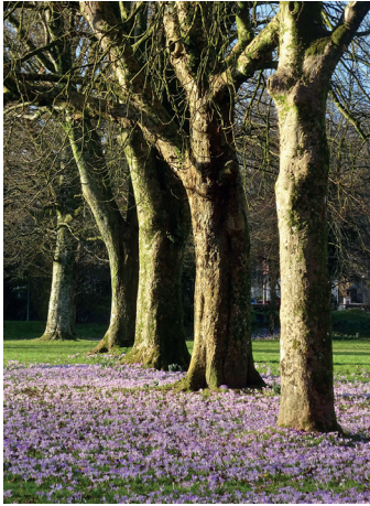
Crocus carpet in The Meadows in early spring