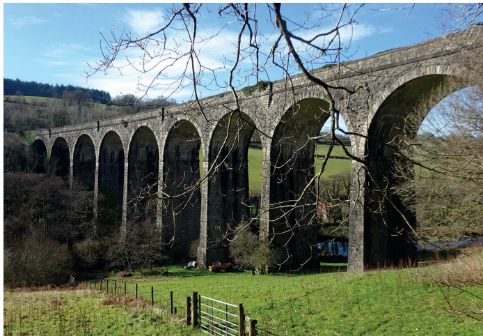
The canal's only lock (reverse view) Trail all along the canal