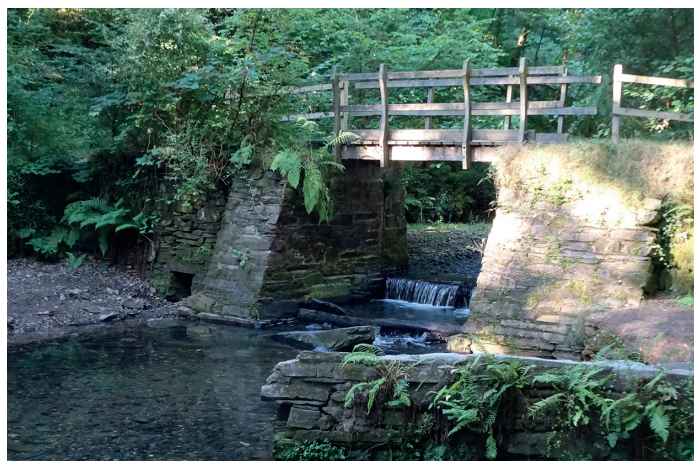
Old weir and footbridge on the Morden Stream above Cotehele Mill