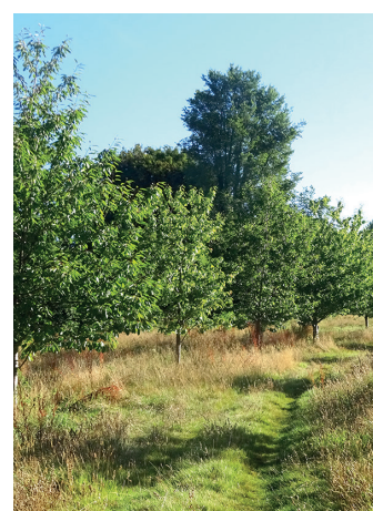
Cherry tree avenue at Newton Farm