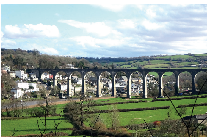
Calstock Viaduct, seen from a viewpoint towards the end of the route