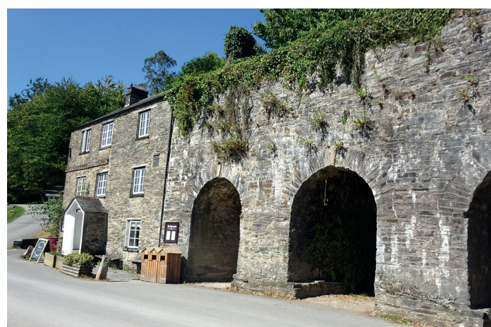
Georgian limekilns on Cotehele Quay