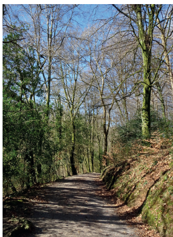
An accessible track follows the valley of Morden Stream above Cotehele Bridge