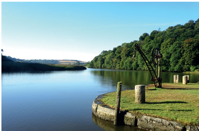
The peaceful River Tamar at Cotehele Quay on a hot summer morning