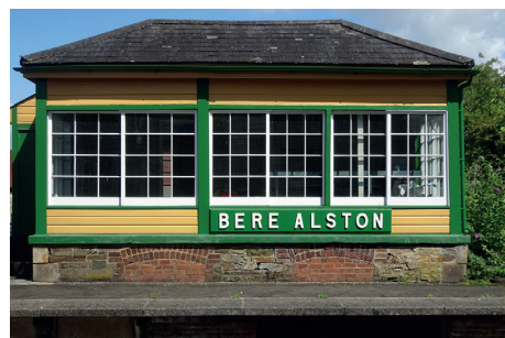
The old signal box at Bere Alston Station