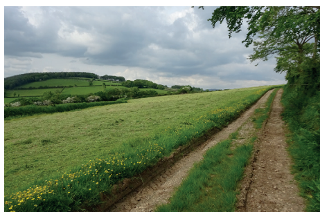
Lovely field-edge path on Point 6