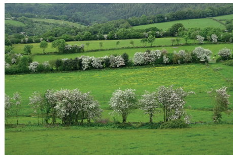
Hawthorn hedgerows at Slymeford