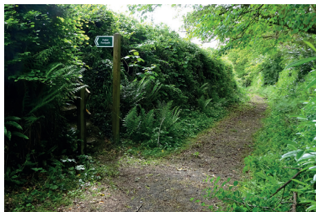
The footpath crosses a track near Rumleigh