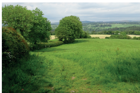
Looking back towards the Tavy valley on Point 7