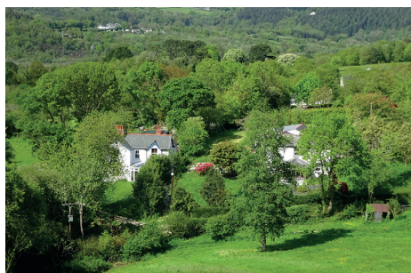
View across old market garden fields towards the Tamar Valley

Keep straight on to meet a track on a bend; keep ahead again, passing houses, eventually turning sharp right to find the station, which opened in 1890 and was important for the onward transport of local market garden produce into the early 20th century.