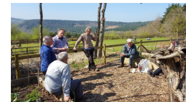
Volunteers at Tamar Trails

Planning applications reviewed and appropriate responses made – 125