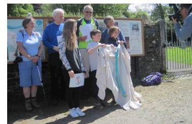
St Dominica Heritage Trail

Tamar Community Trust volunteers – 21 workdays to maintain the legacy of the Mining Heritage Project