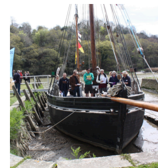
Celebrating Shamrock with the Heritage Guides

Awarded 7 grants to community groups totalling £3,376.00