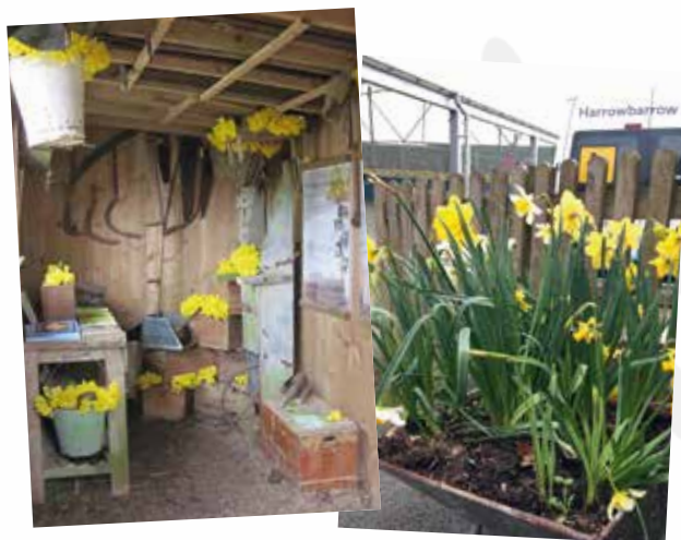
Above, left: Thanks to Harrowbarrow School for this beautiful photo. Harrowbarrow received daffodil bulbs last autumn.