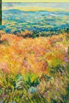
Above; Cream tea with cherries, top right; Apple orchard in May, middle right; Hawthorn and sorrel – towards Pentillie, bottom right; Hot summer evening – view from Kit Hill heathland.