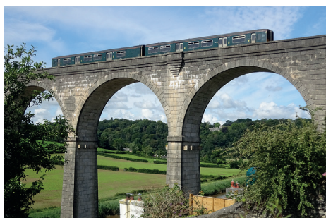
The Tamar Valley Line in action!

Keep straight on through the woodland, descending into the Danescombe valley; turn right to return to Calstock. On reaching Commercial Road turn sharp left back to the station.