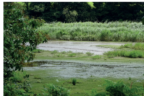
Newly created intertidal marsh on the Calstock estate