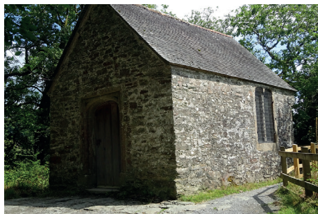
'The Chapel in the Woods'