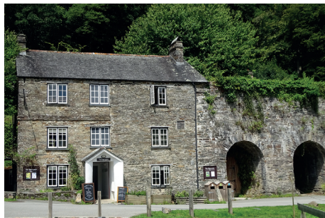
The Edgcumbe and limekilns on Cotehele Quay