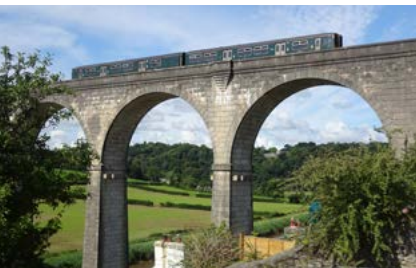
The Tamar Valley Line in action!