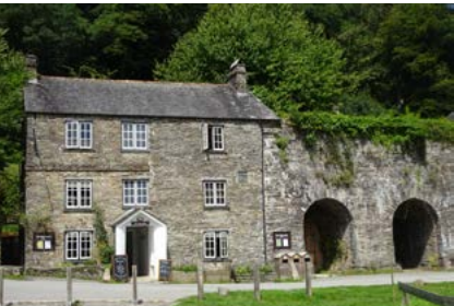
The Edgcumbe and limekilns on Cotehele Quay