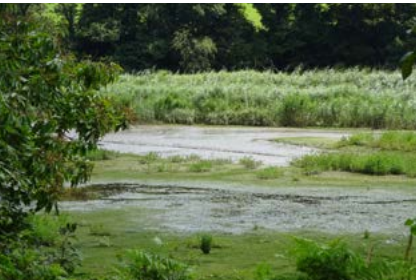
Newly created intertidal marsh on the Calstock estate