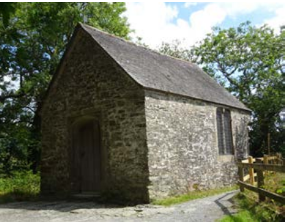
'The Chapel in the Woods'