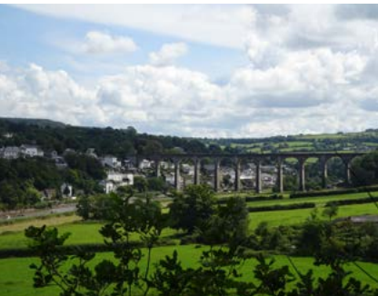
Calstock and the viaduct from the viewpoint in Cotehele Wood