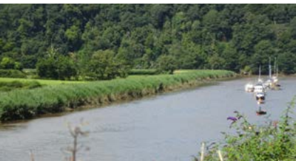
View downriver towards Cotehele Wood