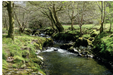
The Walkham is a delightful river