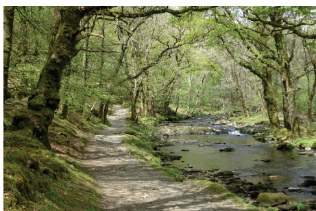
The riverside path in springtime