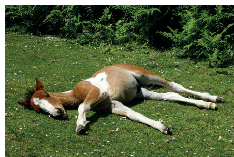
Dartmoor Hill Pony foal on a very hot day!