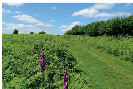
Grassy crisscross through the bracken on West Down