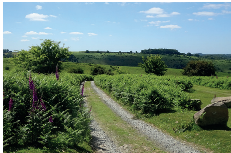
The track heads across West Down