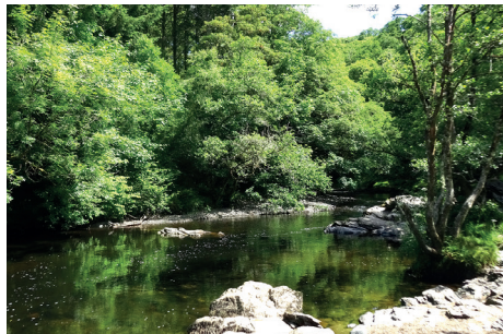
The River Tavy at Double Waters