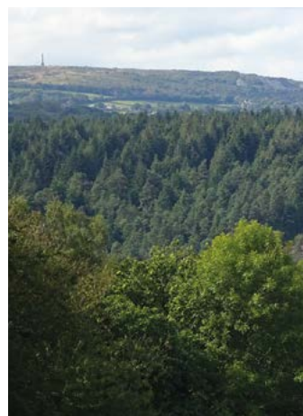
View towards Kit Hill, Hingston Down Quarries, Blanchdown Wood and the vast spoil heaps of DGC