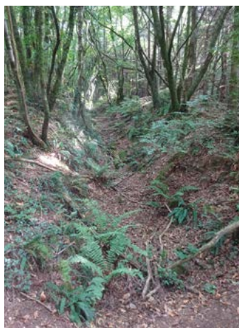
The woodland floor is peppered with trenches and workings

10 SX 433731 Turn left, soon crossing the ochre-coloured outflow of a mine drainage adit, contaminated with copper sulphate and iron oxide. Dams and settling ponds originally reduced the amount of sediment entering the Tamar, and from the 1860s up until the 1960s the stream was channelled into wooden troughs packed with scrap iron, onto which the valuable copper was deposited. Round a gate; a few steps later, at a path junction bear left, steeply uphill. Ignore paths to right and left and follow signs to Sawmill car park. Near the top of the valley side bear right at a fork to re-join the outward route and return to the car park.