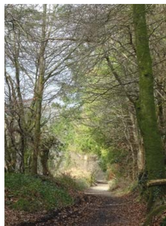
The trackbed of an old mineral railway line is followed towards the mining complex