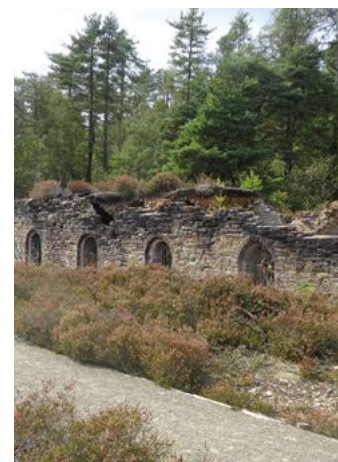
The extensive ruins of Wheal Anna Maria arsenic works