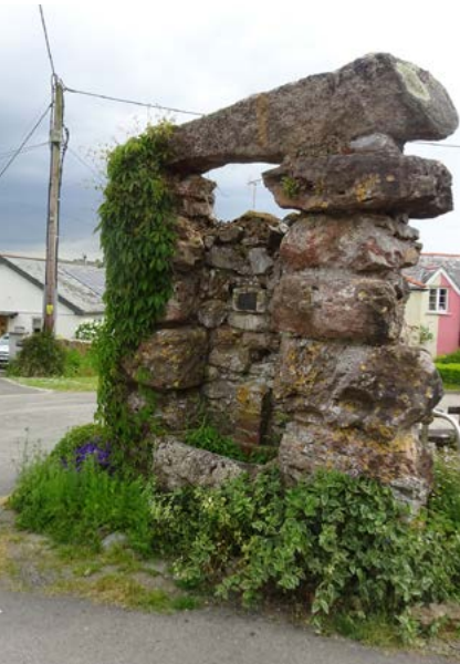
Bere Ferrers' impressive town well