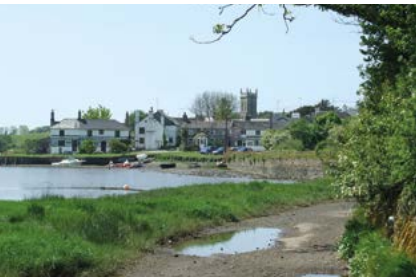
Bere Ferrers hoves into view