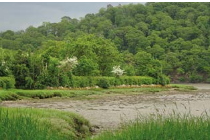
View across the estuary from Gnatham