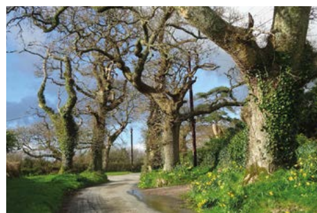
Oak trees and daffodils beyond Pound Cross (long walk)