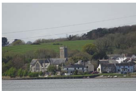
Bere Ferrers comes into view on the west bank of the river