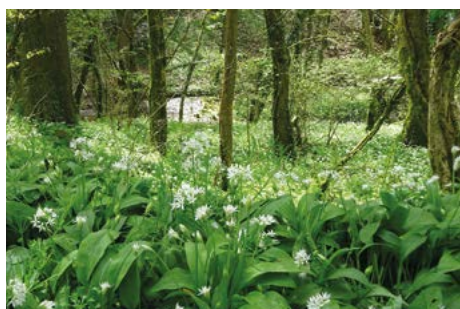
A carpet of ramsons (wild garlic) in Ashleigh Bottom