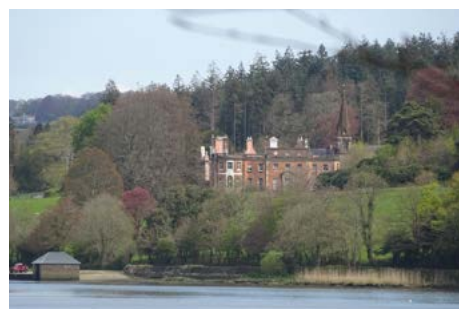
Maristow House, with the quay below