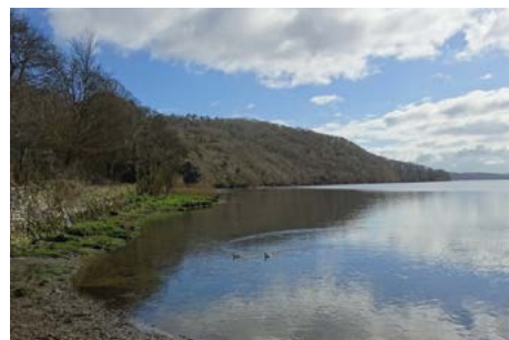
The Tavy broadens below Maristow Quay