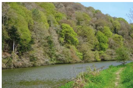
Whittacliffe Wood, seen upriver from the embankment path