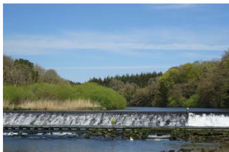
Lopwell Dam: a ferry once crossed the River Tavy here

5 SX 485639 Turn left to pass cottages and a line of superb oak trees. At the next lane junction keep left (Milton Combe right) and then follow the peaceful lane – the views ahead are glorious, stretching into Cornwall – down into the Tavy valley, passing Maristow Barton and another lane to Milton Combe. Continue downhill, eventually bearing right to Lopwell Dam.