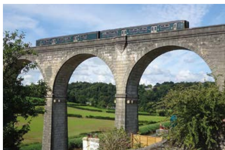
The Tamar Valley Line in action!

Keep straight on through the woodland, descending into the Danescombe valley; turn right to return to Calstock. On reaching Commercial Road turn sharp left back to the station.