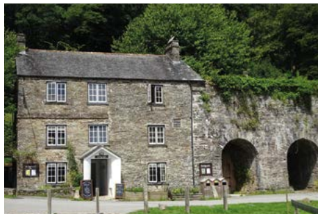
The Edgcumbe and limekilns on Cotehele Quay