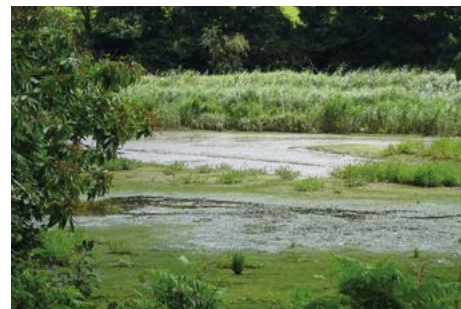
Newly created intertidal marsh on the Calstock estate