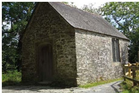
'The Chapel in the Woods'