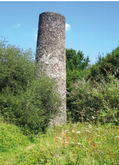
Chimney, Drakewalls Mine