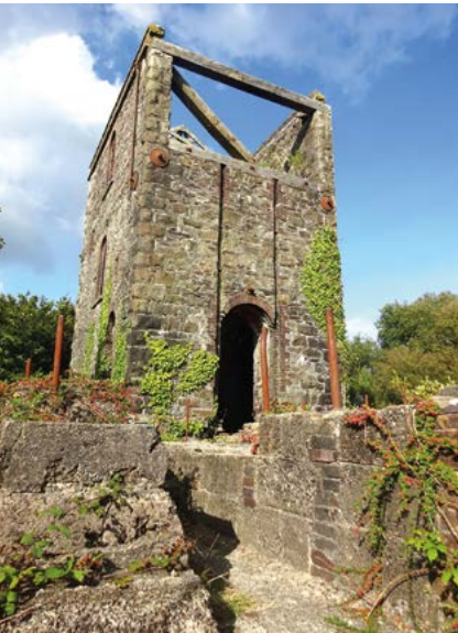
Hingston Down Mine engine house