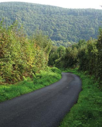
Stony Lane: a steep descent into the valley