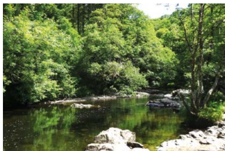
The River Tavy at Double Waters