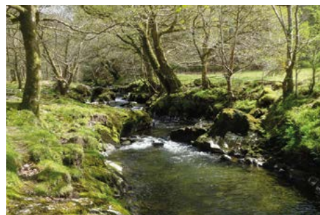
The Walkham is a delightful river