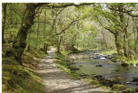
The riverside path in springtime