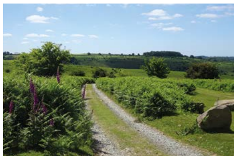
The track heads across West Down