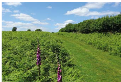
Grassy crisscross through the bracken on West Down